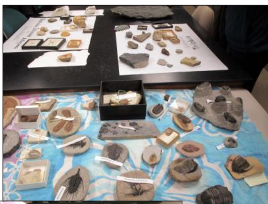
Trilobites - a fossil favorite