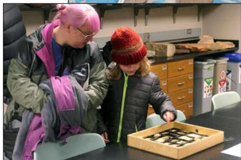
Two attendees examine some fossils