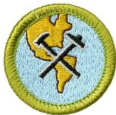
Geology Merit badge