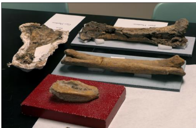
Dinosaur bones and a mammal skull