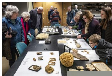
Fossils for everyone