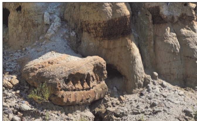
Dinosaur bones in a hillside

form the Cretaceous-Paleogene boundary, formerly referred to as the Cretaceous-Tertiary or K-T boundary. The sandstone hints at a sudden