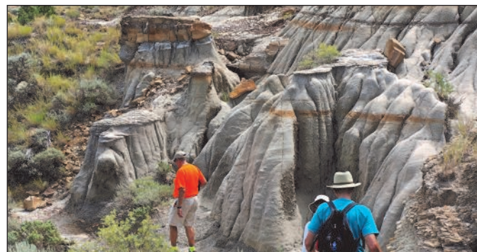
Signs of erosion were everywhere

On a larger scale, the boundary reflects a time when dinosaurs ceased to roam the earth, a time