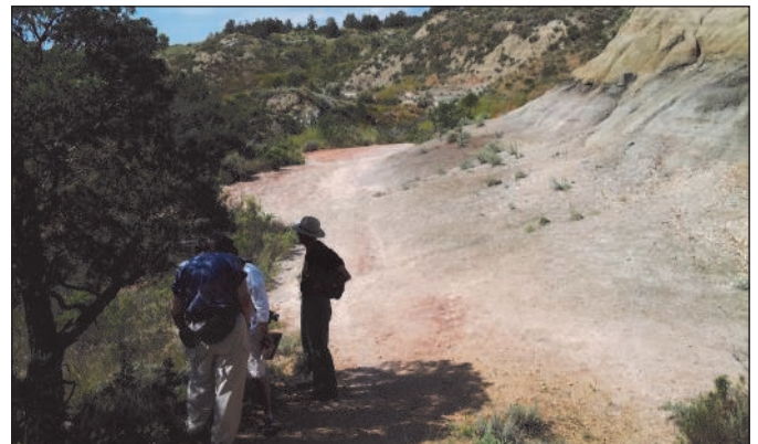
The dark grey band is coal that elsewhere burned and collapsed, leaving pink clinker visible at center

The rock layers had differing levels of resistance to this erosion. Here we saw cap rocks -erosion resistant rocks that at least partially shielded the less resistant rock beneath, atop the abundant hills. Sometimes portions of the cap would be separated, resulting in neat formations called 'hoodoos,' cap rocks on a pillar of softer rock. They are a beautiful