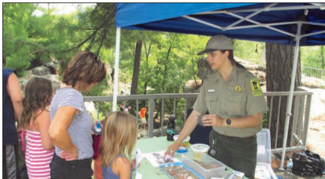
Activities at Rock On Geology Day

Interstate State Park at Taylors Falls is unique in that it is shared by both Minnesota and Wisconsin. The scenic park boasts impressive vertical basalt cliffs, natural potholes, and a view from the bridge into this gorge that is breathtaking. The Park has been a favorite get-away for geologists, hikers, rock climbers, canoeists, nature enthusiasts and children of all ages for many years.