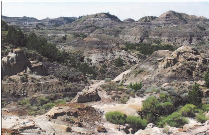
A trail highlighting the beautiful effects of erosion

quickly the world can change, but there's also a feeling of awe and euphoria that comes with touching the boundary. You don't get to touch dinosaur rocks every day! It's an exciting way to start a hike.