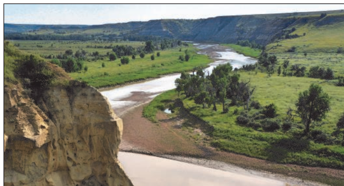
The Little Missouri River looks peaceful and innocent, but it is responsible for the badlands topography we see today

form the Cretaceous-Paleogene boundary, formerly referred to as the Cretaceous-Tertiary or K-T boundary. The sandstone hints at a sudden