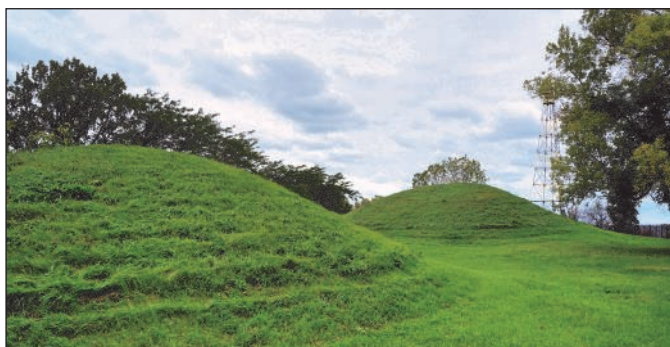
Burial Mounds