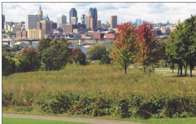
Restored prairies in the foreground; downtown St. Paul in the background

gouged out the river channel. Eventually the waterfall split. The St. Anthony Falls obviously still exist on the Mississippi River, but the Minnesota falls eventually disappeared when it ran out of the Platteville layer.