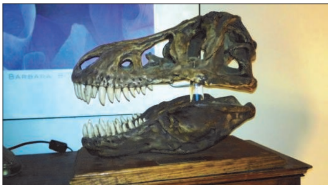
Trex skull cast

(aka free labor) to help extract the fossil bones from the ground. Forty-five percent of the skeleton was recovered. Another special find occurred while