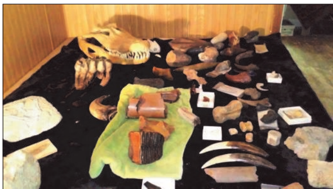
Teeth and claws

Roger’s talk focused on trilobites. According to Roger, there are 10 orders of trilobites, over 150 families, and about 5000 genera, with new species