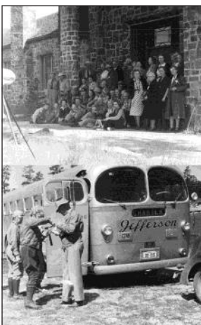
from the archives: Trip to the Black Hills, South Dakota, circa 1947.