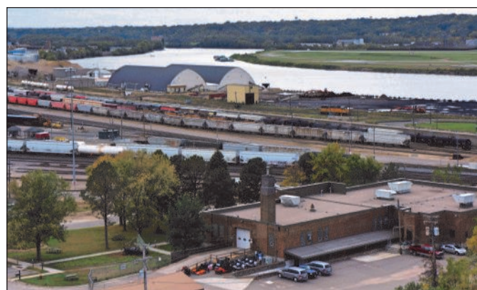
Fish hatchery in the foreground; the Mississippi in the background