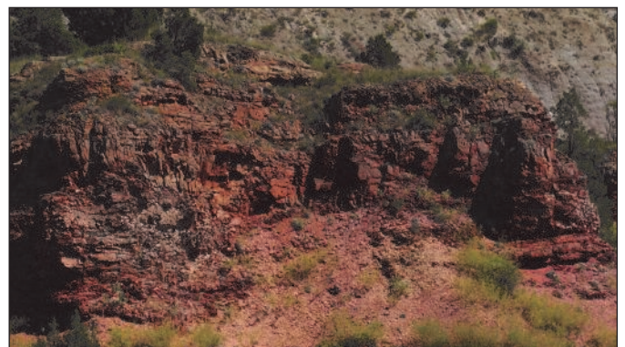
Pink clinker is a hint that coal once burned here

We experienced this badland terrain again at