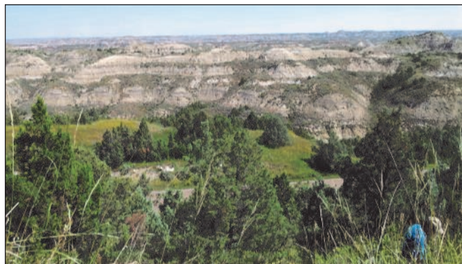
Badlands, Mikoshika State Park

"I touched dinosaur rocks!" That's the easiest way I've found to explain to the non-geology people in my life the thrill of touching the Cretaceous-Paleogene boundary in Mikoshika State Park in