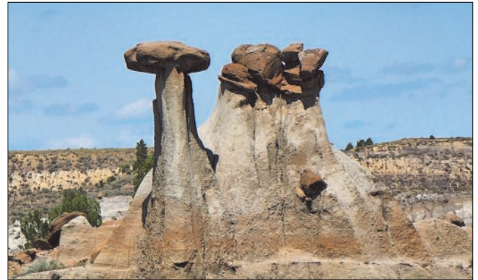
Hoodoos are common in the badlands

causing it to tear apart the landscape, exposing the soft and easily erodible layers that continue to retreat today under the erosive pressures of wind