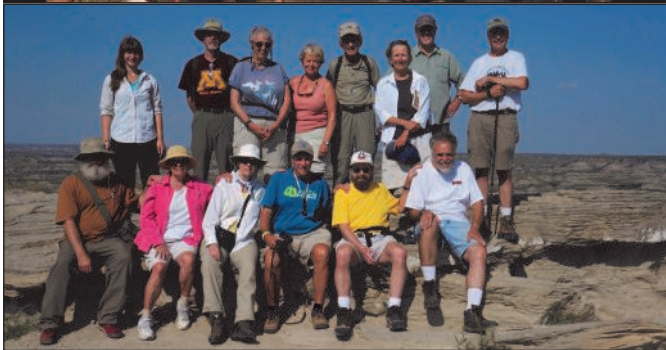
At Theodore Roosevelt National Park

we can walk over the collapsed ground with rose colored clinker and see black coal on the hill and appreciate the power of burning rock in changing the landscape.