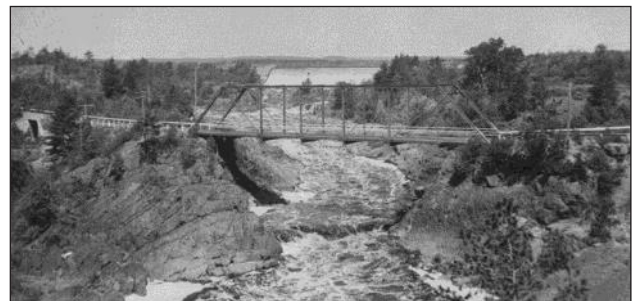
Thomson Falls, GSM Fieldtrip, 1939

The Minnesota Geological Survey is facing a budget cut of at least 8% for the coming two years as state lawmakers enter the final stage of wrestling with the state budget. The MGS is funded through the University of Minnesota’s budget bill. The budget request submitted to the Legislature by Gov. Tim Pawlenty included deep cuts in funding for all higher education institutions.